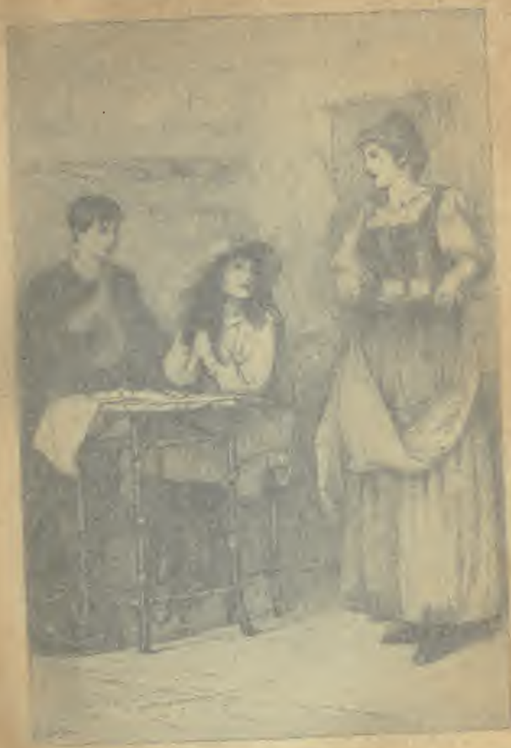
she had previously brought back two good cups of tea.